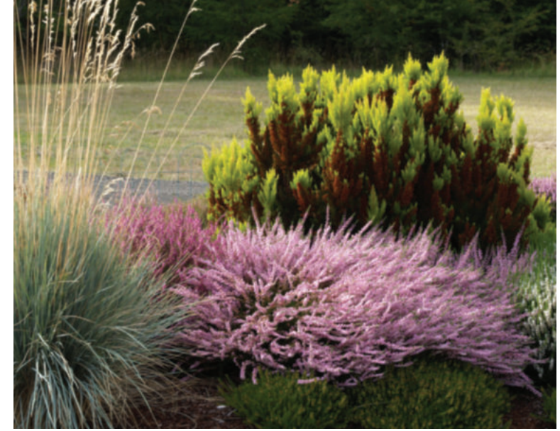
The heather sale is back on April 2, 2022 in the Cowichan Valley.

If you are new to gardening on Vancouver Island you may be asking yourself why you would plant heathers in you garden. These plants qualities without being invasive, are evergreen, hardy and require little rich for these plants. maintenance. They are relatively free from pests and disease and, last but not least, other than bud bloomers the flowers provide wonderful nectar your winter flowering heather on a sunny February day and you will agree with me.