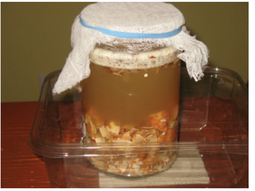
Eggshells fermenting in cider vinegar will be ready March 29 for use as a soil amendment.

First I made apple cider vinegar by soaking my apple leavings in water for two months at room temperature, then straining the fluid out and leaving it to