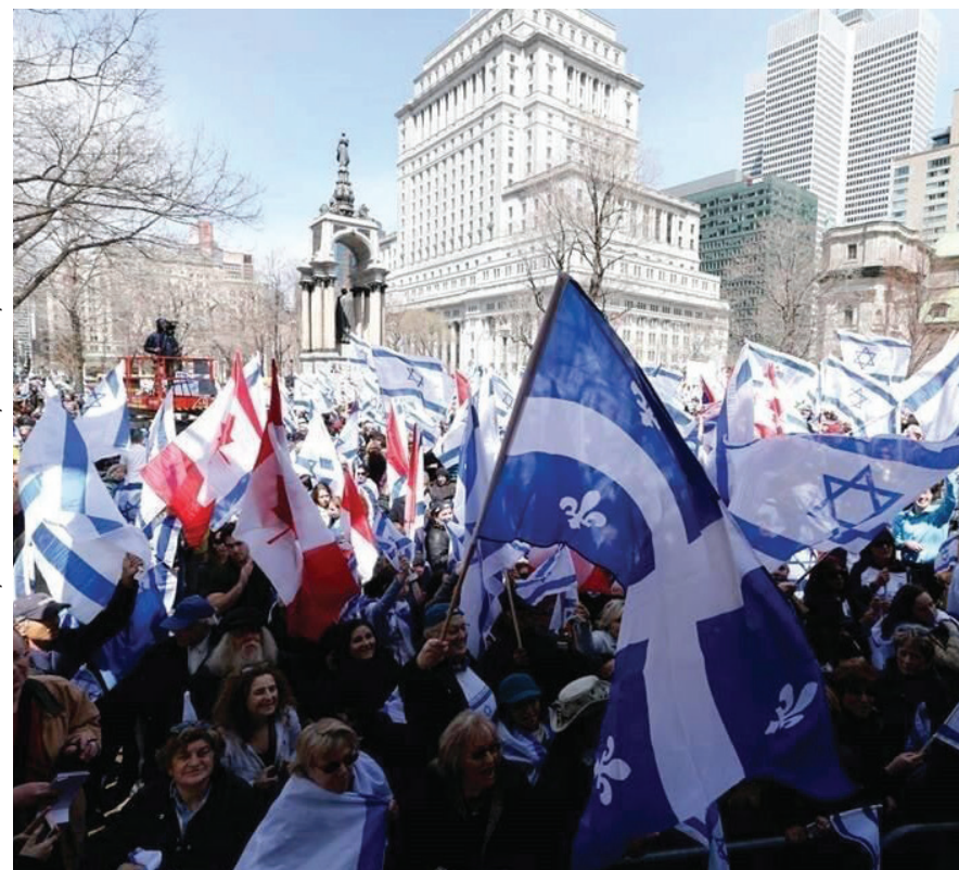
A12 • THE SUBURBAN, WEDNESDAY, MAY 4, 2022

If the Jewish people – in its national as well as religious manifestation — is the “canary in the mineshaft of history,” a phrase regularly employed by historians, then Israel is also the litmus test of the ability of western civilization to survive. It is the frontline member of the family of free nations facing the existential challenge of Islamist fundamentalism. It may very well be that as Israel goes, so goes the west. But it is heartening to see that Israel is making common cause with so many Arab governments against that very same fundamentalism. Israel may very well be the free world's hope for only with the alliances with Arab governments can the extremists be brought to ground. This is truly something to celebrate.