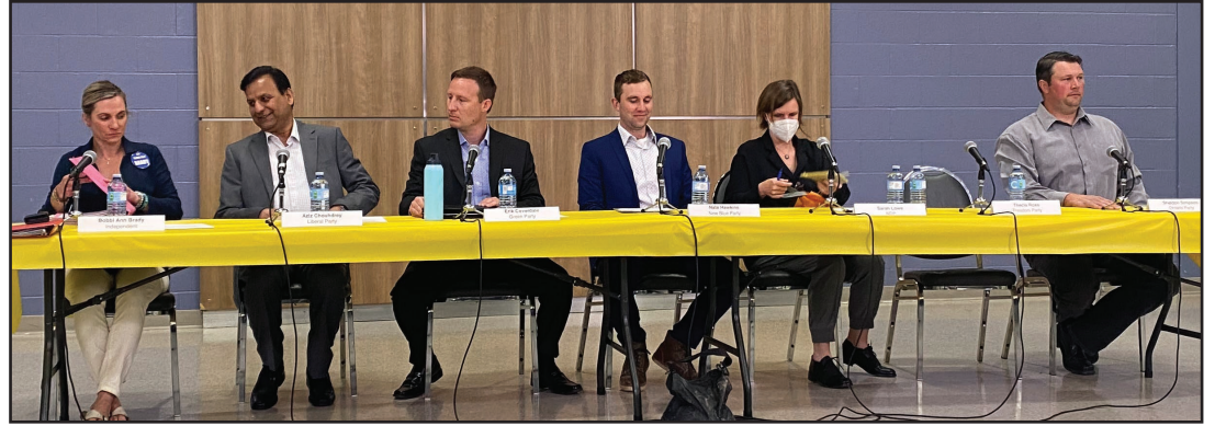
CALEDONIA—The Haldimand Press' debate was held at the Caledonia Lions Community Centre on May 18, 2022.