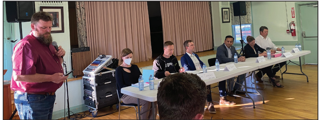
KOHLER—The Haldimand Federation of Agriculture's debate was held at the Kohler Agricultural Hall on May 17, 2022.

They deserve to stay at their homes as long as possible."