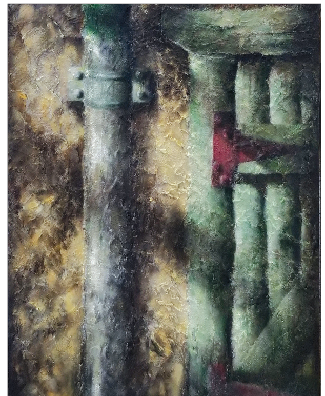
Details of dwellings by John Bowyer are also on display.