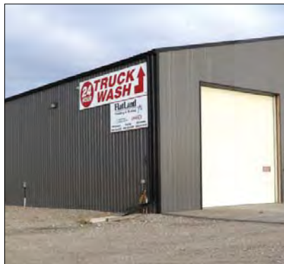
Flatland Plumbing & Heating's new location in Moosomin.

"There is not much we don't do," he says. "We'll do everything from service work like fixing taps and replacing toilets, to sewer augering, to installing furnaces and water heaters. We do new housing and renos, and we are getting more and more into the commercial side of things too, so we'll do big shops. We did a big Department of Highways shop a few years ago. We do wells, septic sys-