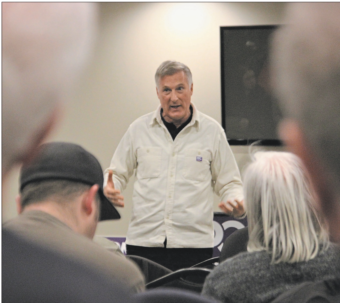
NICOLE BUFFIE THE CARILLON

People's Party of Canada leader Maxime Bernier stopped in Steinbach Saturday evening for a meet and greet event at Smitty's. The federal leader revealed he's looking to relocate to Manitoba ahead of the 2025 election to earn a seat in the House of Commons.