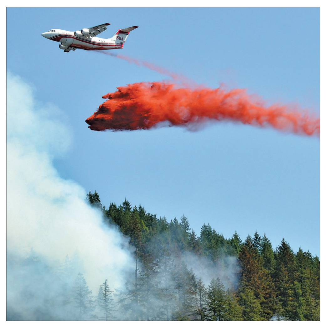
A BC Wildfire airtanker drops a load of fire retardant on a West Vancouver fire near Horseshoe Bay on Monday.