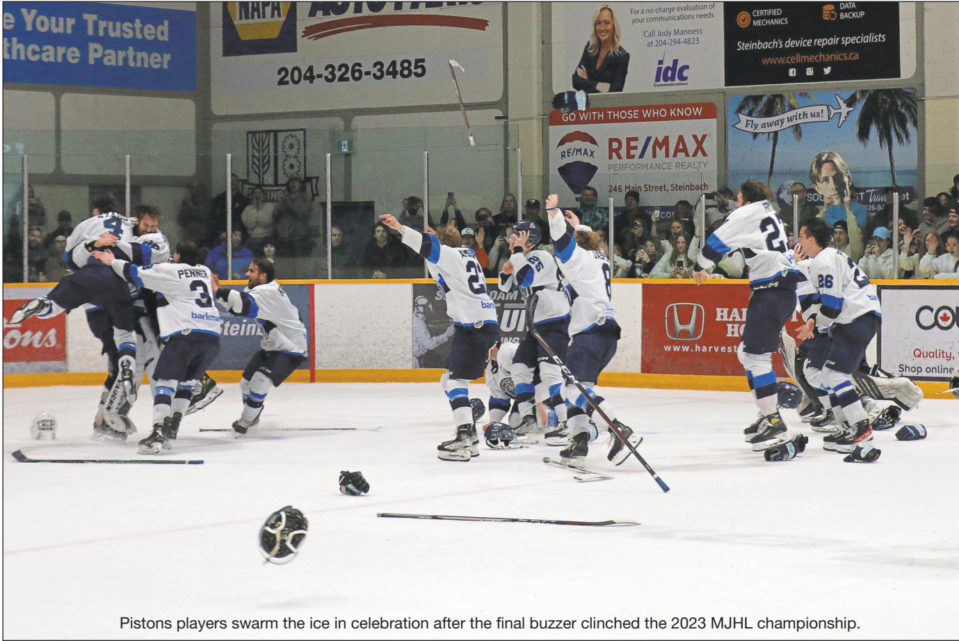
Pistons players swarm the ice in celebration after the final buzzer clinched the 2023 MJHL championship.