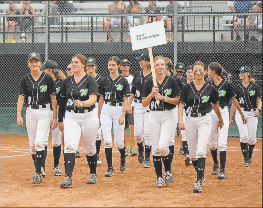
The Eastman Wildcats walk into the opening ceremonies at the U15 National Softball Championships in Saskatoon in 2022. They were the first Wildcats team to make a national championship, and the squad had a solid showing, finishing sixth.