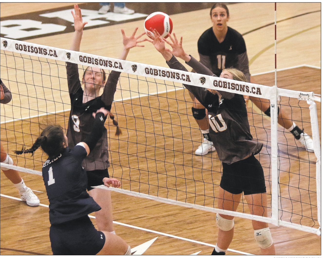
Selkirk took advantage of seams in the SRSS block whenever they could, before mid-game adjustments improved the Sabres' defense.

Vincent Massey would win the boys AAAA final, as Steinbach was knocked out in the preliminary round after losing to Transcona.