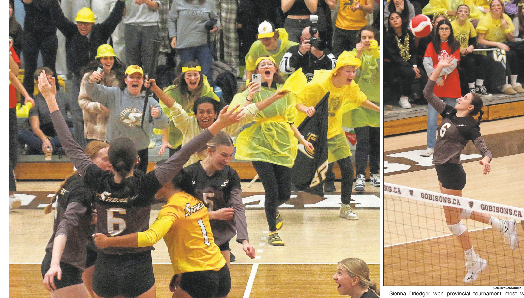
Fans rush the floor to celebrate with the AAAA provincial champion varsity girls Sabres team.