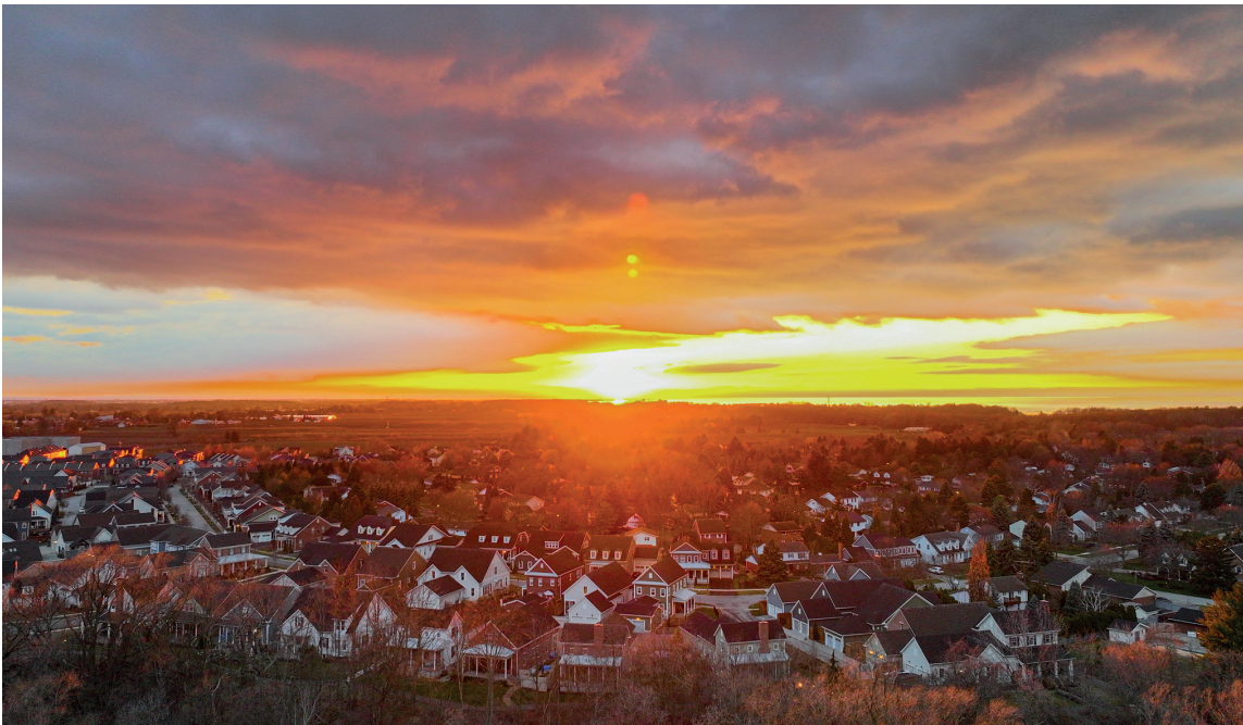
A drone captures the beauty as the sun sets over Niagara-on-the-Lake, casting an orange glow over the town on Friday, March 15. One might think it's a fall photo, with all the red colours.